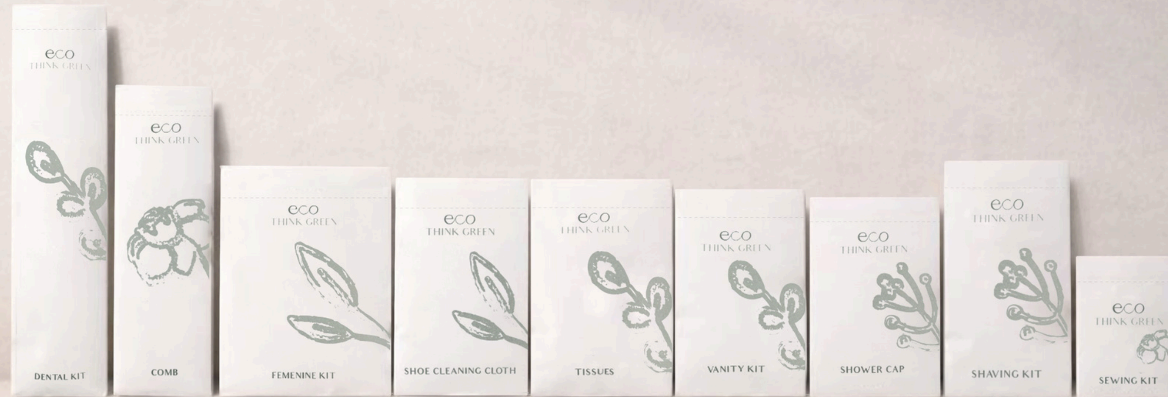
DENTAL KIT | COMB | FEMENINE KIT | SHOE CLEANING CLOTH | TISSUES | VANITY KIT | SHOWER CAP | SAVING KIT | SEWING KIT