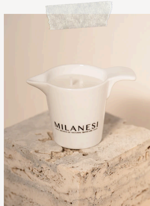
SPA THERAPY SET

A set of three Relaxing Candle Oils in different fragrances. Designed as a complete wellness ritual, ideal as a gift or for exclusive spa experiences.