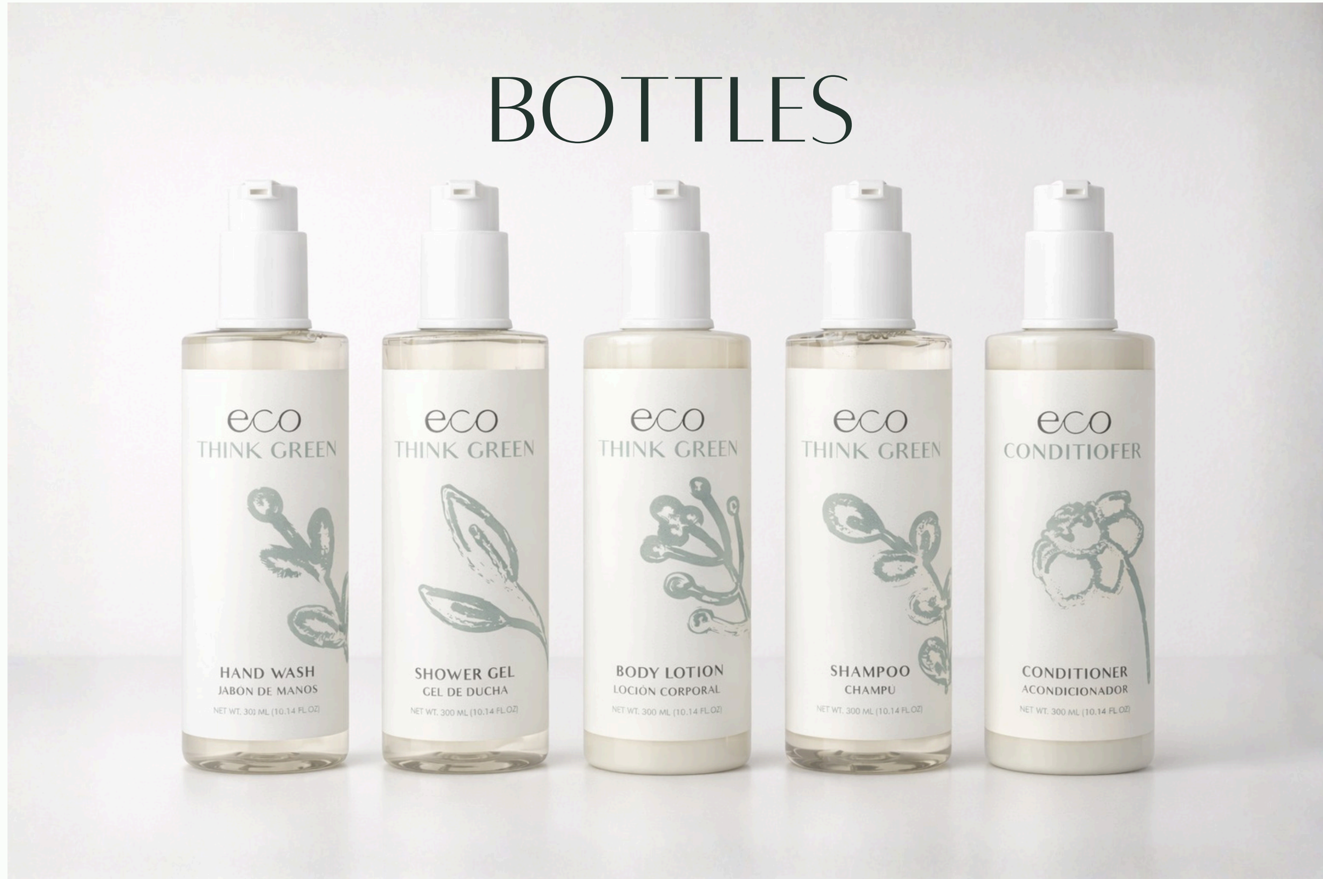
HAND WASH | SHOWER GEL | BODY LOTION | SHAMPOO | CONDITIONER