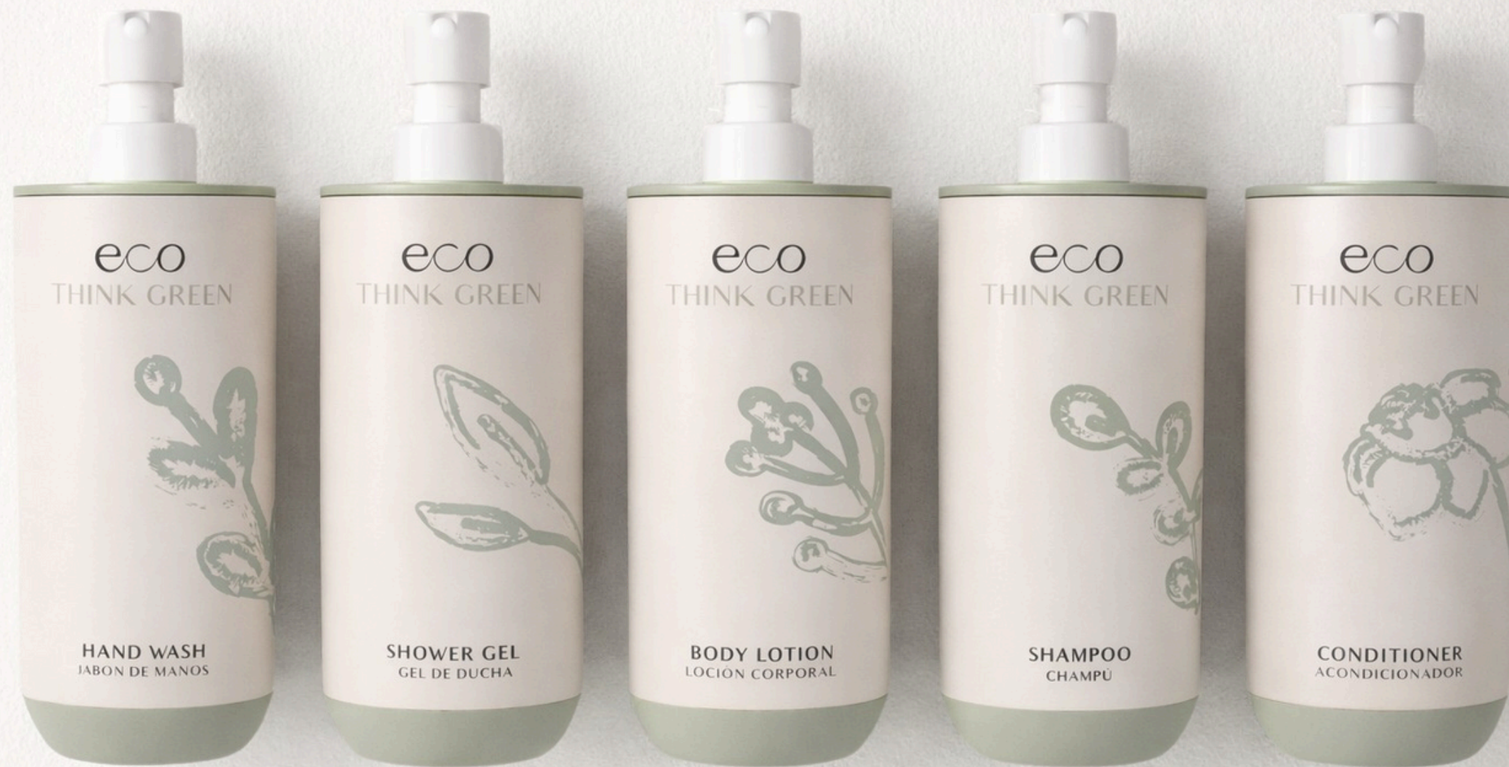
HAND WASH | SHOWER GEL | BODY LOTION | SHAMPOO | CONDITIONER