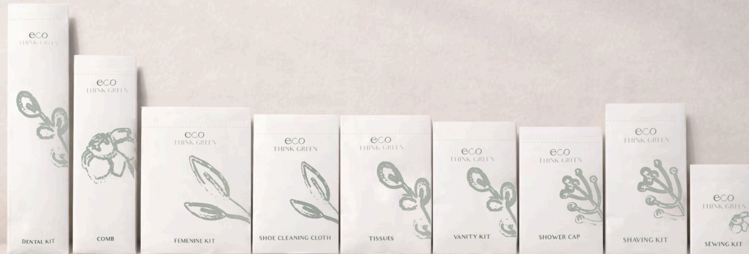
DENTAL KIT | COMB | FEMENINE KIT | SHOE CLEANING CLOTH | TISSUES | VANITY KIT | SHOWER CAP | SAVING KIT | SEWING KIT